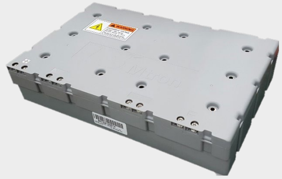
* This is an image for reference.

It can be applied in wind power, hybrid systems, industrial automation, power backup and stabilization. Imagination is its only boundary.